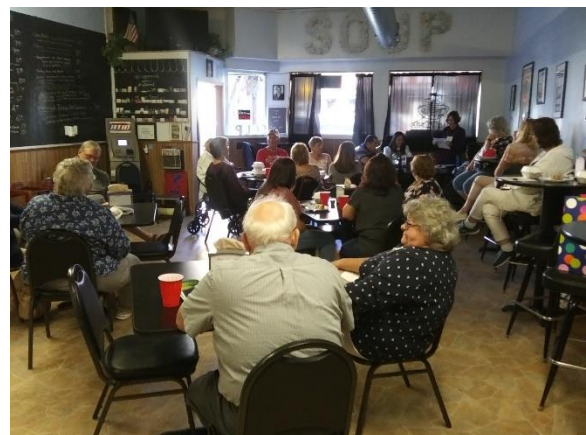
August 8 th Annual Literacy Volunteers and Supporters Appreciation Dinner at Oyster Cracker in Montello

Grants in the amount of $300 were given to Endeavor, Packwaukee, Oxford, and Montello. Westfield received $282. These libraries are an important partner in literacy!