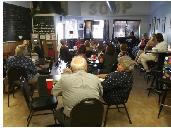
August 8<sup>th</sup> Annual Literacy Volunteers and Supporters Appreciation Dinner at Oyster Cracker in Montello

Grants in the amount of $300 were given to Endeavor, Packwaukee, Oxford, and Montello. Westfield received $282. These libraries are an important partner in literacy!